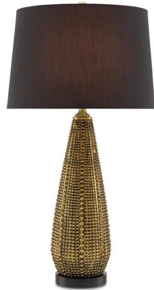
Moirrey Table Lamp

The Vivienne Chandelier is a wonderful mix of hand-formed metal leaves, linen, and crystal drops. The design was obviously inspired by a pineapple. The most famous Georges Bizet opera, Carmen, is the creative namesake of Currey's new Carmen Chandelier. Like the gypsy character of the opera, the chandelier is ornamented with flowers. Seventeen lights shine outward from a perfectly sized orb to create abundant illumination. Carmen is finished with a grainy silver leaf, which we call Silver Granello.