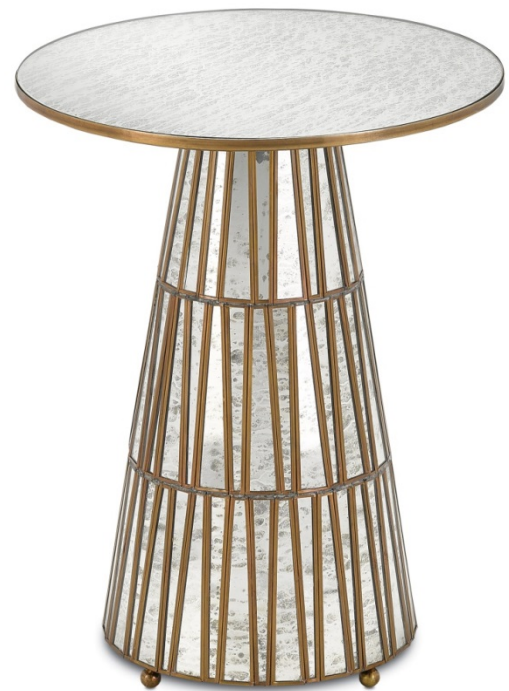
Cicely Accent Table

Like a very ripe fruit, the Ginza Table Lamp, speaks an organic design language. Made of hand-formed terracotta, the bold black and tan pattern is inspired by traditional African mud cloth and topped with a coarse linen shade. It's back to the natural world for the Moirrey Table Lamp. The ceramic form is beautifully textured with a raised pattern inspired by the surface of a sea urchin. The antique gold and black glaze completed with a black shantung shade is the perfect finish