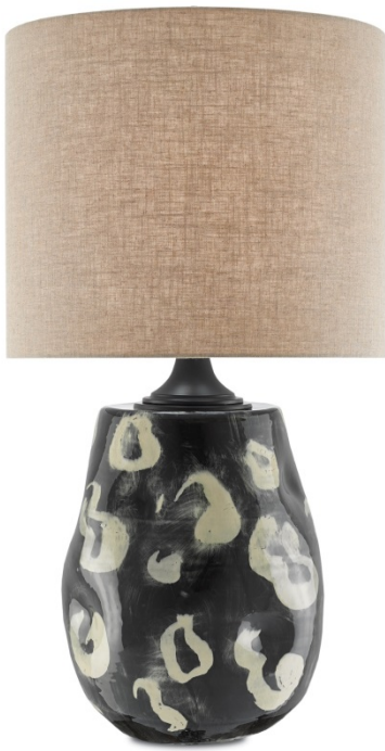
Ginza Table Lamp