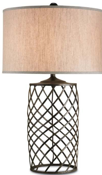
Dashiell Table Lamp

Pendant lighting plays an important role in modern, industrial designs. The N'est Pas Pendant, so versatile and functional, would look great hung in multiples or solo. The Hiroshi Gray, Antique Red & White finish gives a modern take on a vintage look. The smooth surface of the Archway Pendant is also finished with Hiroshi Gray and an off white interior. Gray is trending to be the new black and works as an understated neutral in any room.