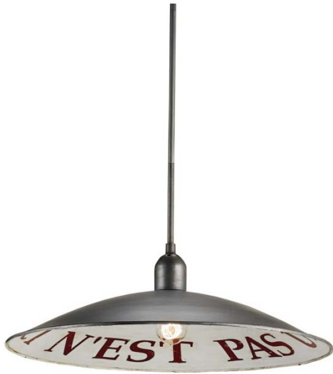
N'est Pas Pendant