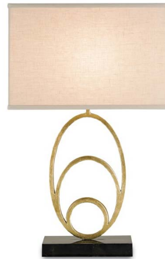
Firelight Table Lamp

The bewitching Orli Chandelier is hand finished with Contemporary Gold Leaf. The circular ring design is simple yet glamorous. Any interior will be elevated by the glowing warmth of this chandelier. The understated Firelight Table Lamp is a combination of stark simplicity and sumptuous details. A light beige linen shade tops the lamp body with a real gold leaf finish and a rich, black penshell base. This jewel will embellish the interior of any room!