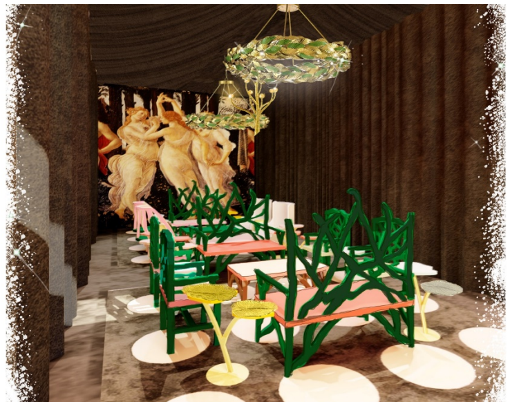
Artist Renderings of the Installations